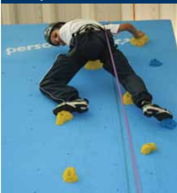
At the summit!