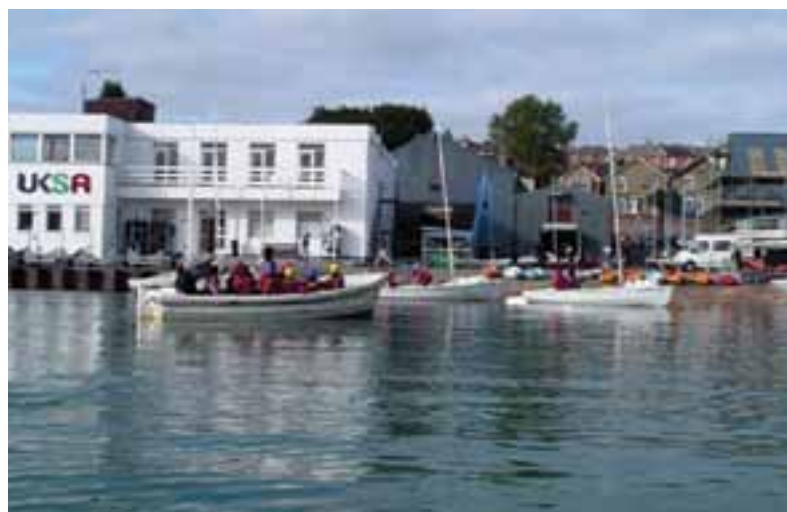
Learning new skills at the UK Sailing Academy.