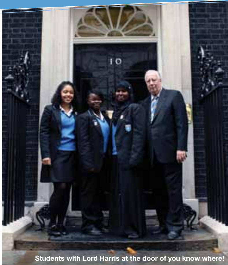
Students with Lord Harris at the door of you know where!

Watch out for details of our new sports lab, which arrives in 2010, containing the very latest technology to monitor what happens to the body during exercise, plus different ways of measuring speed and agility. Work on the new Harris Wing, due to open in January 2011, is also on schedule.