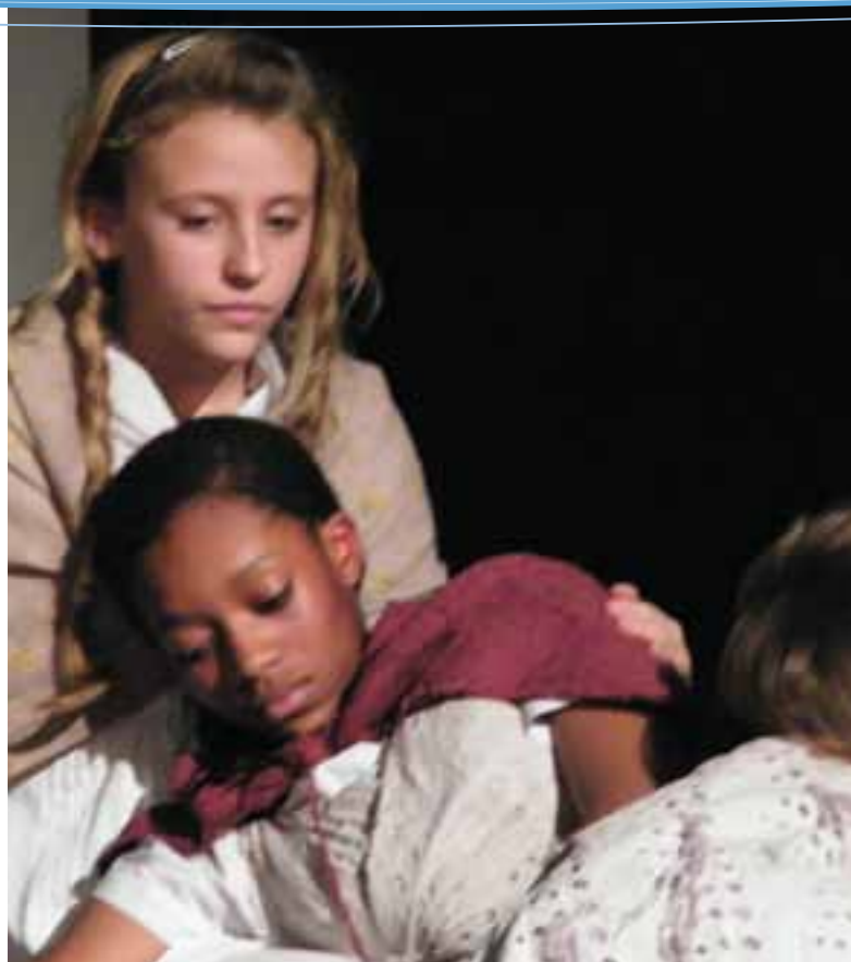
Students perform Ragged Child in our recently re-equipped school hall.