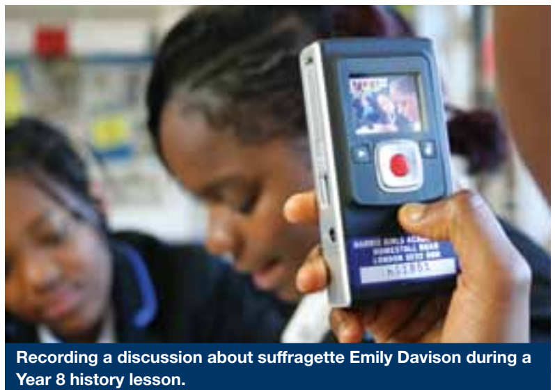
Recording a discussion about suffragette Emily Davison during a Year 8 history lesson.

The cameras provide a useful addition to traditional writing – giving another engaging way to record ideas.