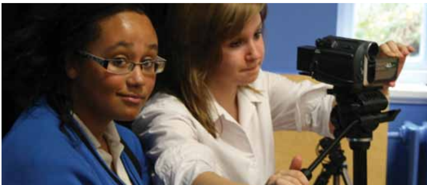
Filming the debate to share with others.