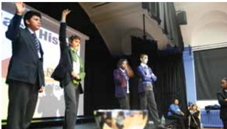
Students take part in the Black History Month debate.

This was the subject of a special debate held in October at HGAED to mark 2009 Black History Month. Students from seven Southwark secondary schools gathered at our academy to learn debating skills and test them in a live debate in front of other students. Our team had five students (one each from Years 7–11) and came second overall – a very impressive performance.