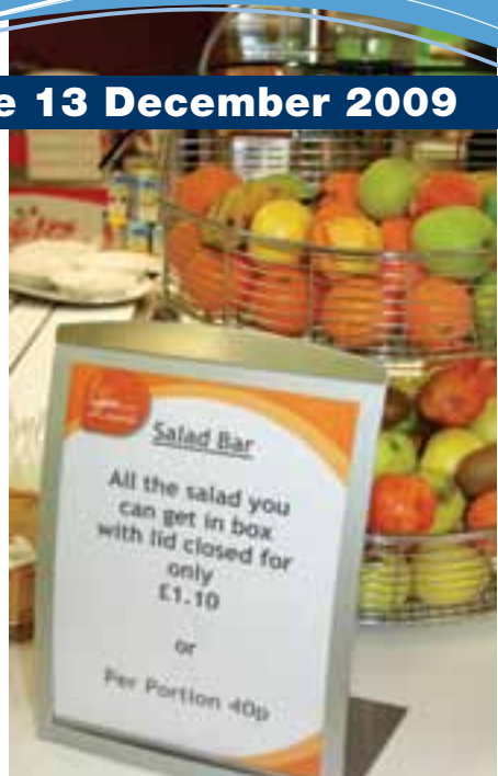
Salad bar and fruit on offer daily.

The new canteen features brightly coloured seating areas with a choice of tables, chairs, stools and bar-top areas. 'There's a variety of tasty, healthy options including a meal of the day which is always popular with students,' says Sandra Simpson of catering company Sodexo, which has a contract to run the canteen.